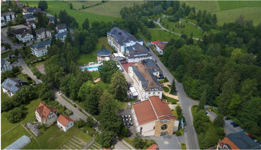
AERIAL VIEW STEIGENBERGER HOTEL DER SONNENHOF