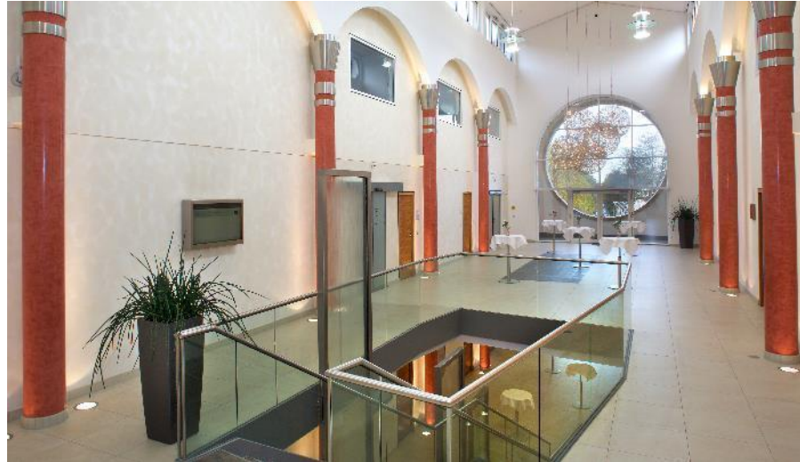
FOYER FIRST FLOOR INSPIRA